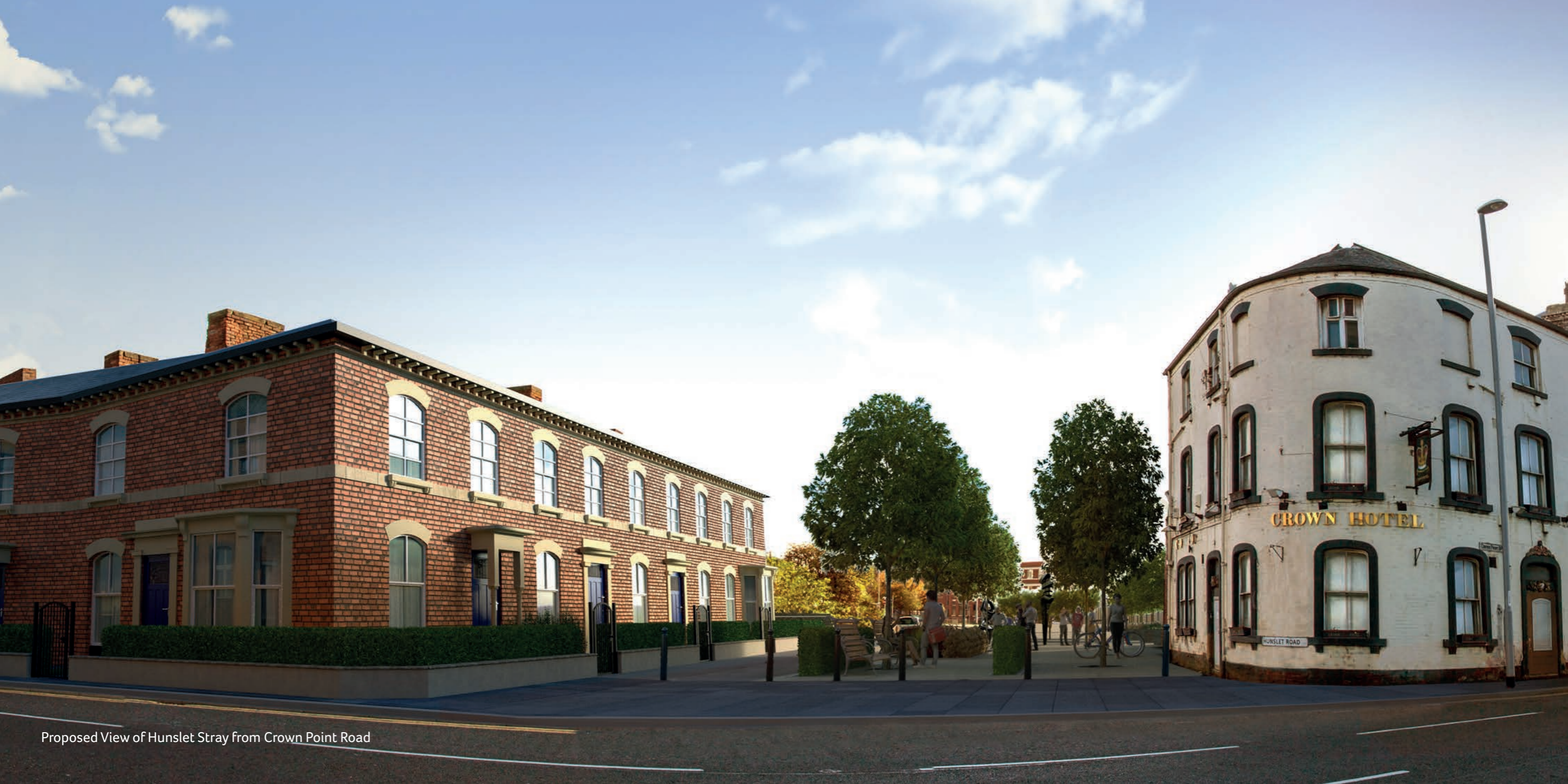
Proposed View of Hunslet Stray from Crown Point Road