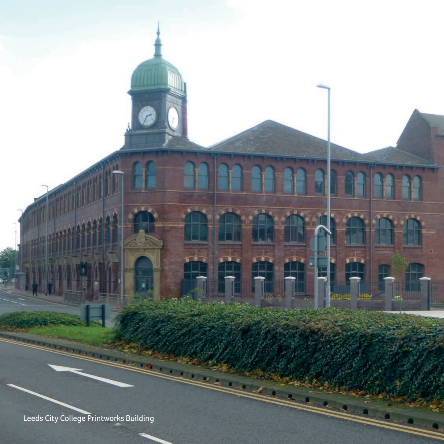
Leeds City College Printworks Building