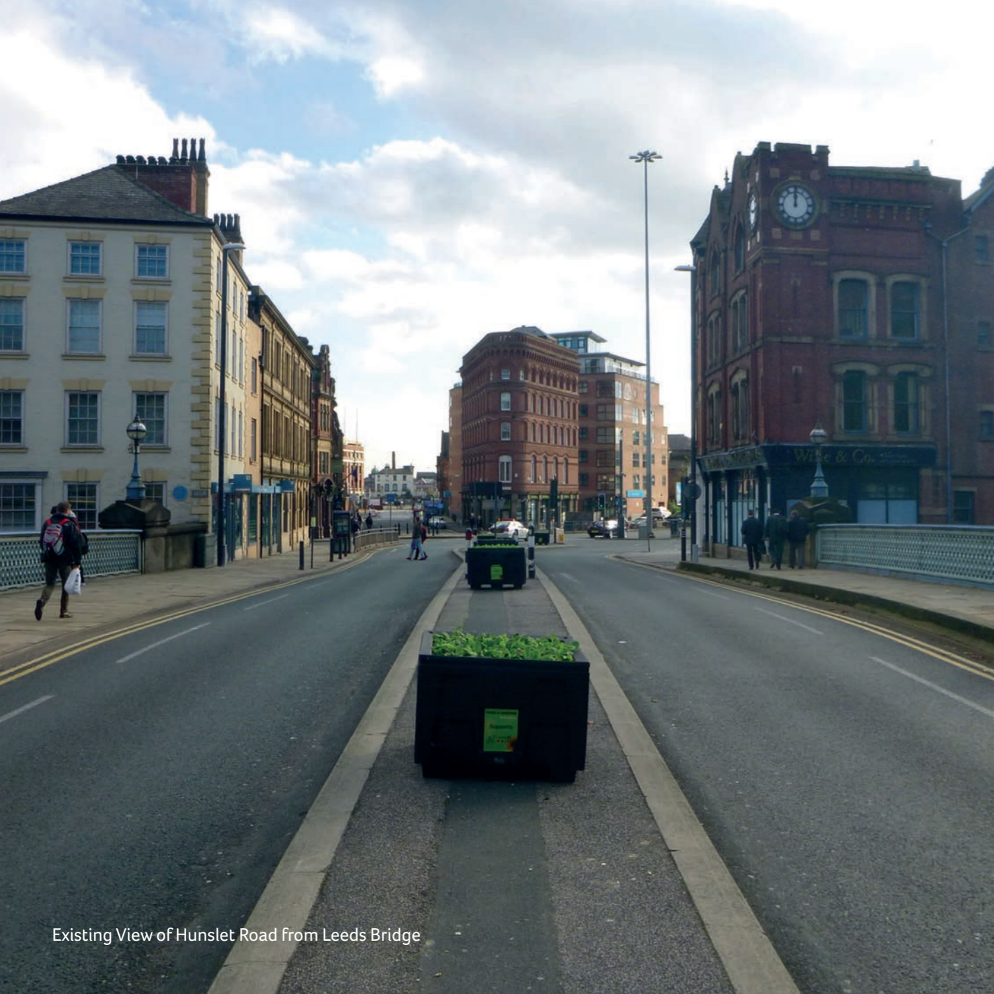
Existing View of Hunslet Road from Leeds Bridge